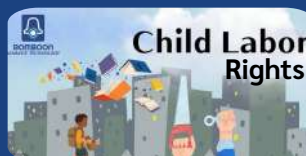
Child Labour Rights