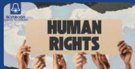
Fundamental Human Rights