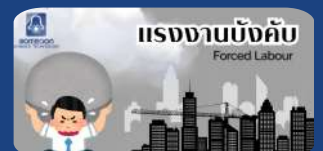
Forced Labour Rights