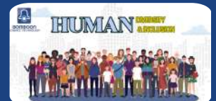
Respecting Diversity and Differences