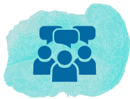
Dialogue to Understand Community Needs

The Company adopts the Department of Industrial Works’ Corporate Social Responsibility (CSR-DIW) standard system as its operational framework, alongside annual stakeholder engagement dialogues and community surveys to understand local needs and design initiatives that effectively respond to the community context. This approach is guided by 3 principles of participation: employee engagement, community participation, and the development of sustainable initiatives