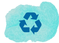
Projects Fostering Sustainability